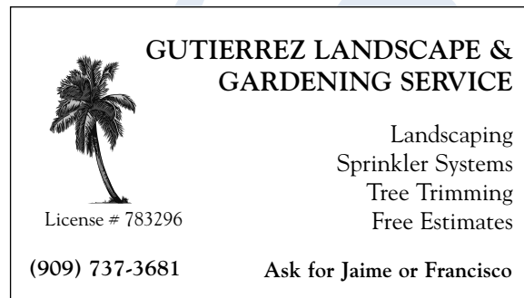
Design Principle: Proximity