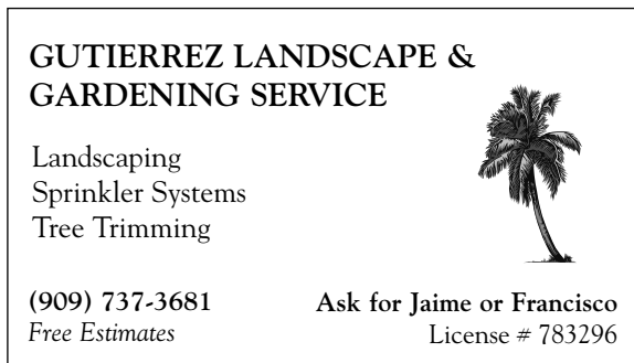
Design Principle: Alignment