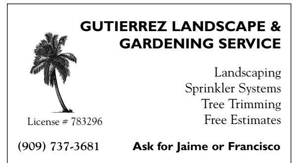
Design Principle: Contrast